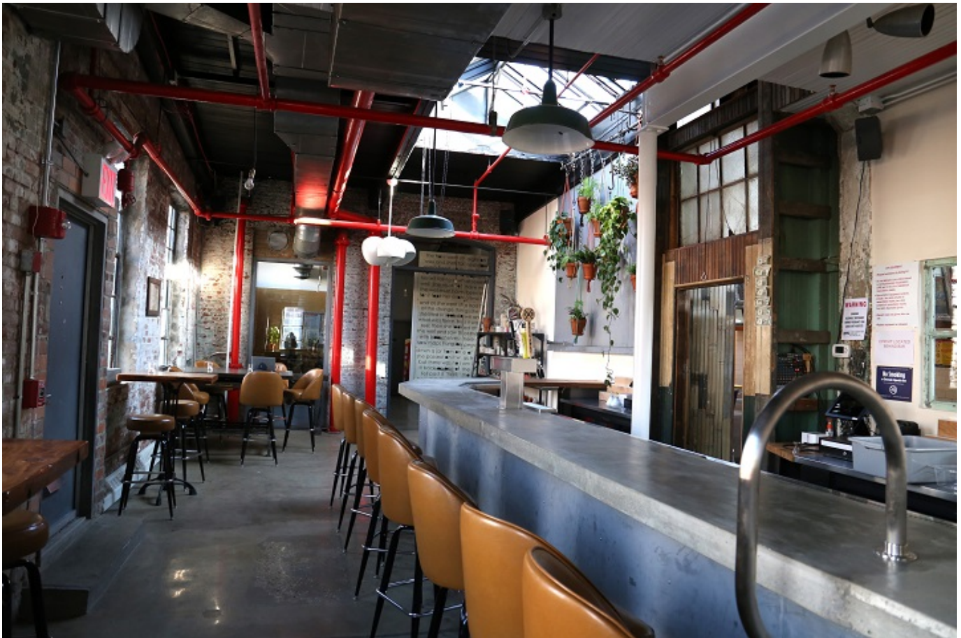
The Ready Room Bar

The Ready Room is set to open on June 10 and will be open on Thursdays from 5 p.m. to midnight, Fridays 5 p.m. to 2 a.m., Saturdays from 2 p.m. to 2 a.m., and on Sundays from 2 p.m. to midnight.