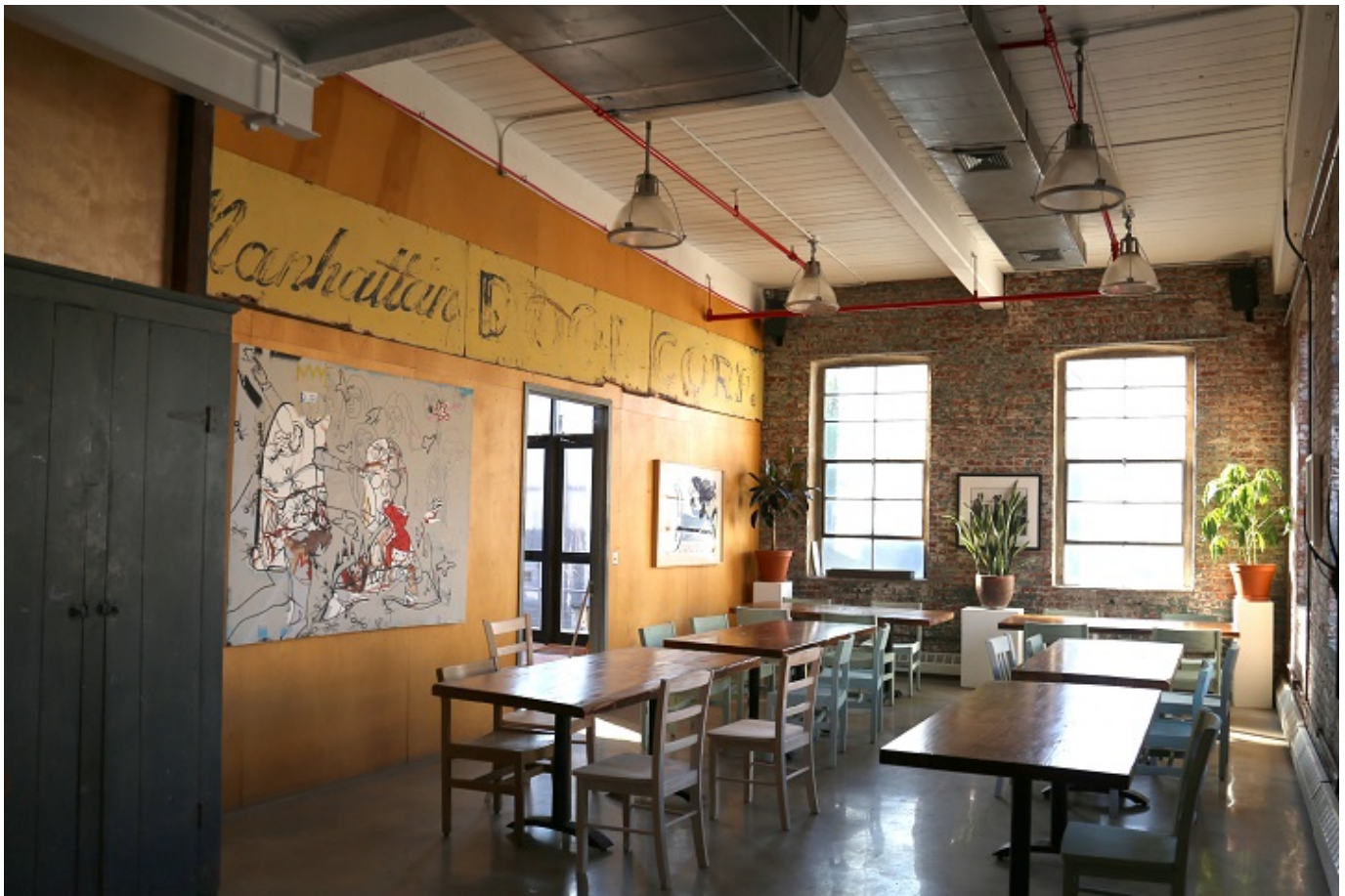
The dining area of the Ready Room